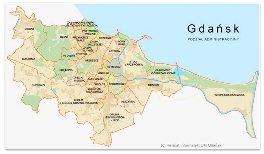
Figure 2. Administrative structure of Gdańsk.